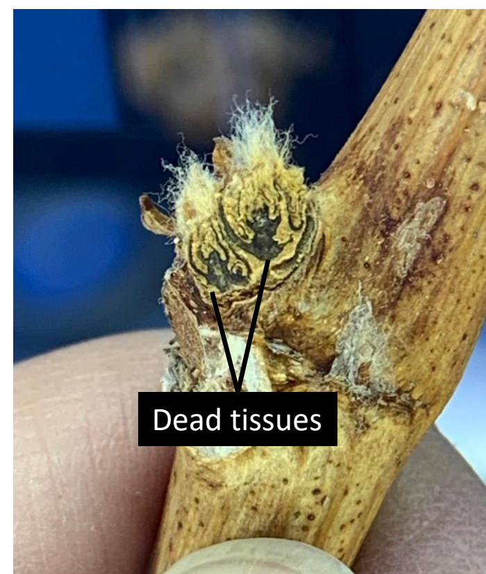
Remnant tissue LTE signals